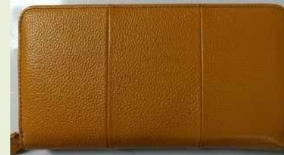
Style#:AL-616 Material: Leather Country Name: JAPAN