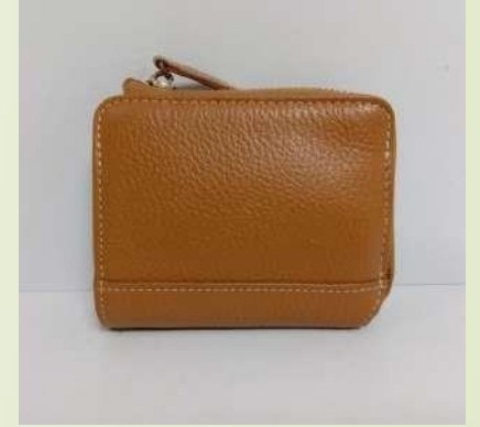
Style#:CDC-412R2 Material:Leather Country Name: Japan