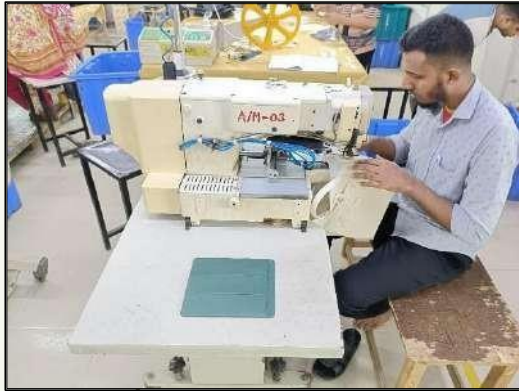
Auto Computer Machine