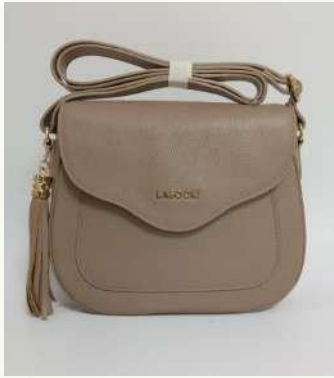
Style#:BRT-681 Material:Leather Country Name:Poland