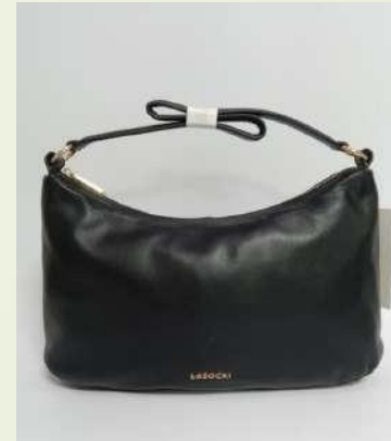
Style#: BRT-873 Material:Leather Country Name: Poland