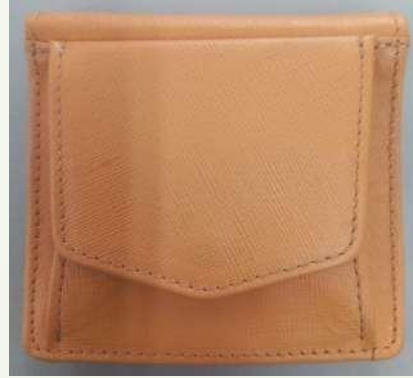
Style#:AL-522 Material: Leather Country Name: IAPAN