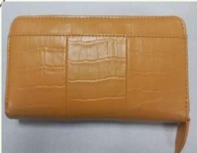
Style#:AL-632 Material: Leather Country Name: JAPAN