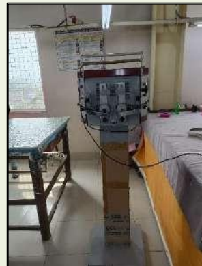
Belt Color Machine