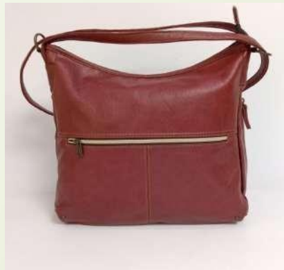
Style#:AL-612 Material:PU Country Name: Japan