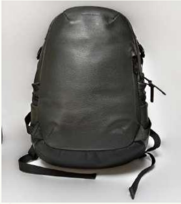
Style#: BBOM-1240 Material: Leather Country name: Japan