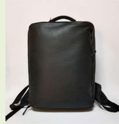
Style#: BBOM-1234 Material:Leather Country Name: Japan