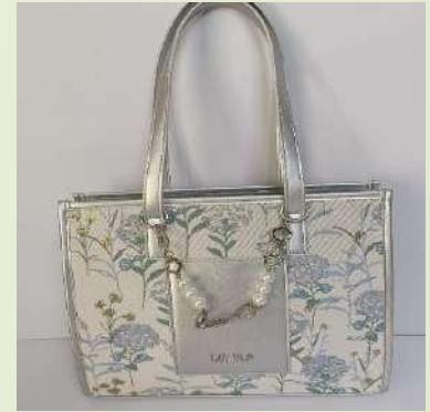
Style#: LD-14 Material: PU Country name: Canada