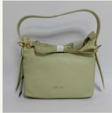
Style#: BRT-884 Material:Leather Country Name: Poland