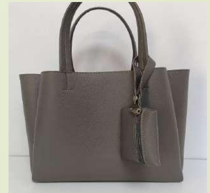
Style#: 2501 Material: PU Country name: Japan