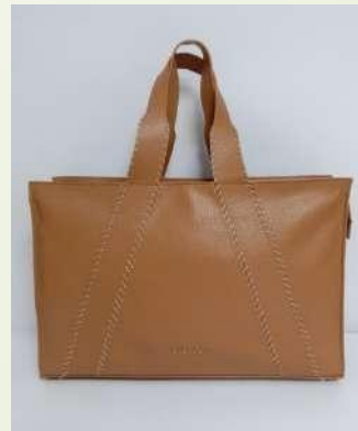
Style#: BRT-889 Material:Leather Country Name: Poland