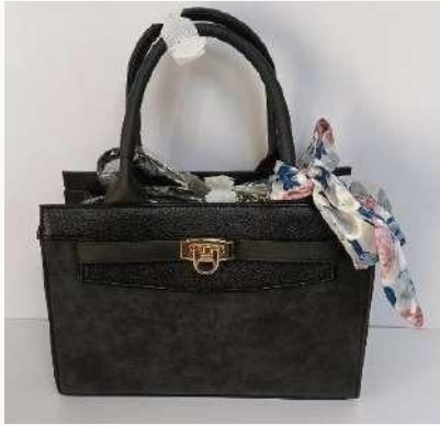
Style#:LD-03 Material: PU Country Name: Canada