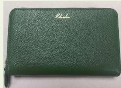
Style#:AL-656 Material: Leather Country Name: JAPAN