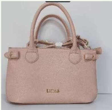
Style#: LD-08 Material: PU Country name: Canada