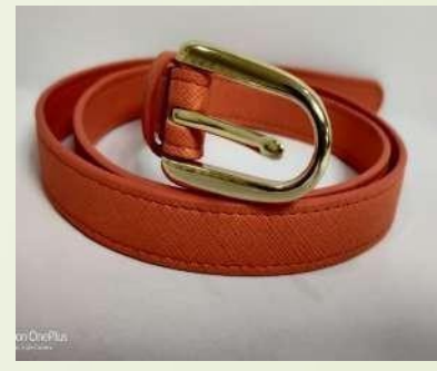
Style#: Ladies Belt-02