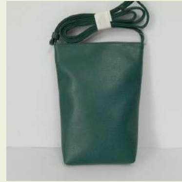
Style#: AL-621 Material: PU Country Name: Japan