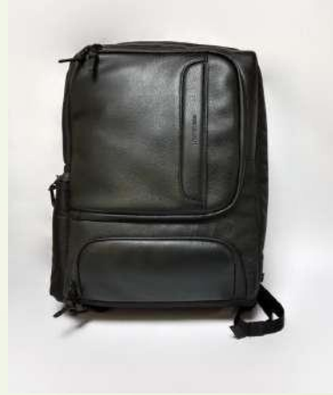
Style#: BBOM-836 Material: Leather Country Name: Japan