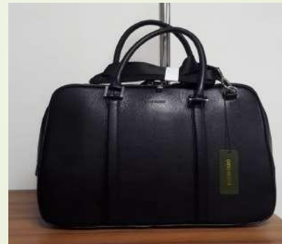
Style#: GR-30 Material:Leather Country Name: Poland