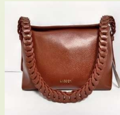
Style#:BRT-856 Material:Leather Country Name: Poland