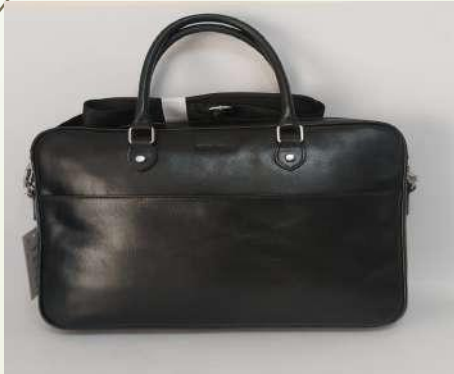
Style#: GR-100 Material:Leather Country Name:Poland