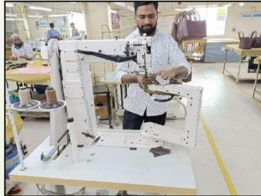
Arms Moving Post Bed