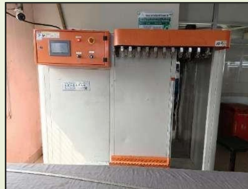
Painting Drying Machine