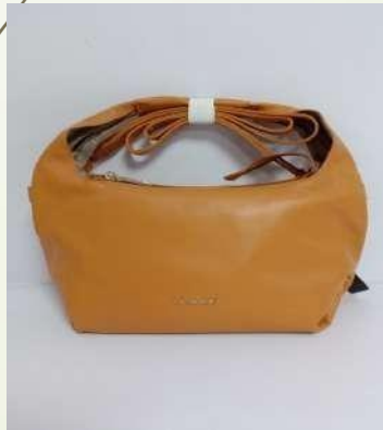
Style#:BRT-883 Material:Leather Country Name:Poland