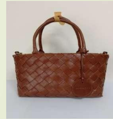
Style#:CDC-479R2 Material: Leather Country Name: Japan