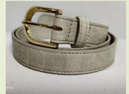
Style#: Ladies Belt-05