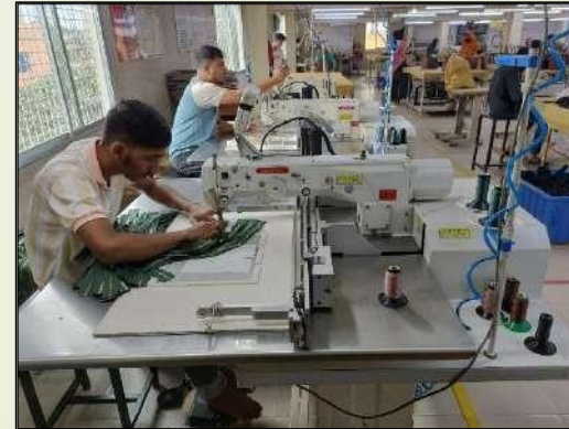
CNC Machine 300 X 600