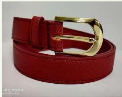
Style#: Ladies Belt-07