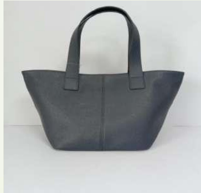
Style#: AL-611 Material: PU Country Name: Japan