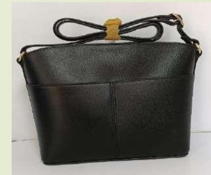
Style#:CDC-548R Material: Leather Country Name: Japan