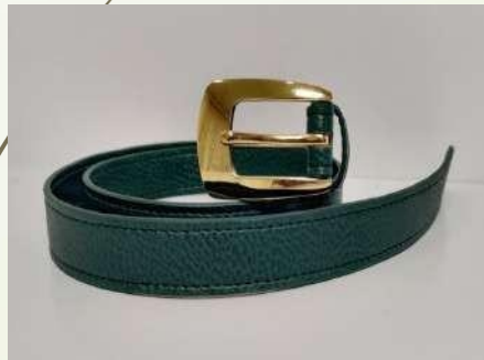
Style#: Ladies Belt-03