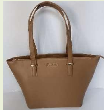
Style#:LD-15 Material:PU Country Name: Canada