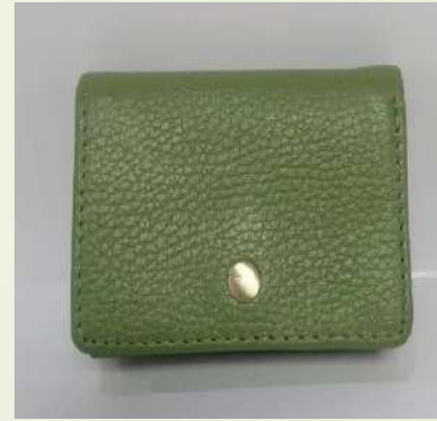
Style#:AL-518 Material:Leather Country Name: Japan