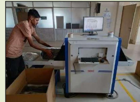
Needle Detector Machine