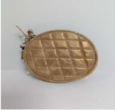
Style#:22AL310 Material: Leather Country Name: USA